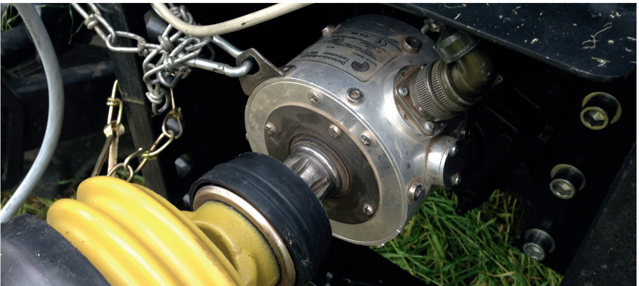
Figures 9 and 10: Kistler Correvit L400 and Walterscheid 2.5 kNm measuring hub on the rear PTO