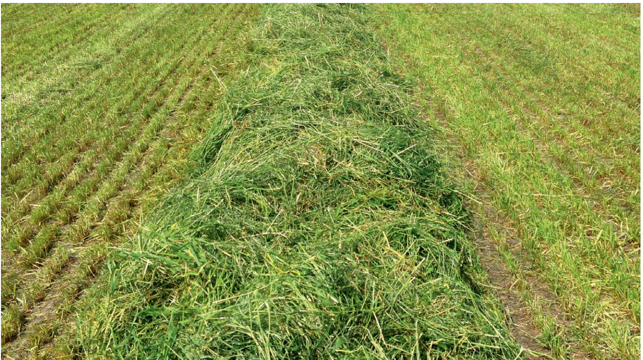
Figures 12 and 13: Windrow conditions on the test field