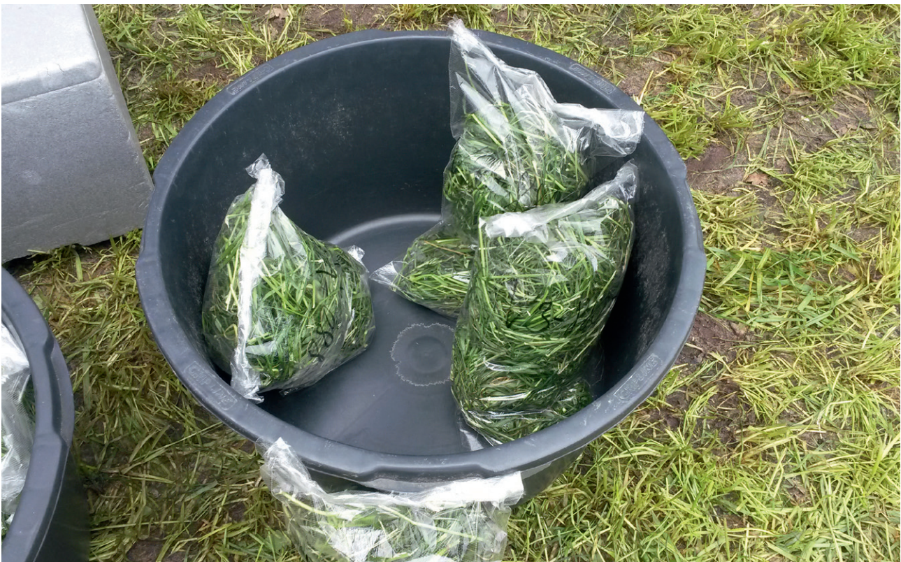
Figure 7: Grass samples in perforated bags

The theoretical area treated per hour (ha/h) is calculated from the measured travel speed and the actual working width and therefore does not take account of turning times.