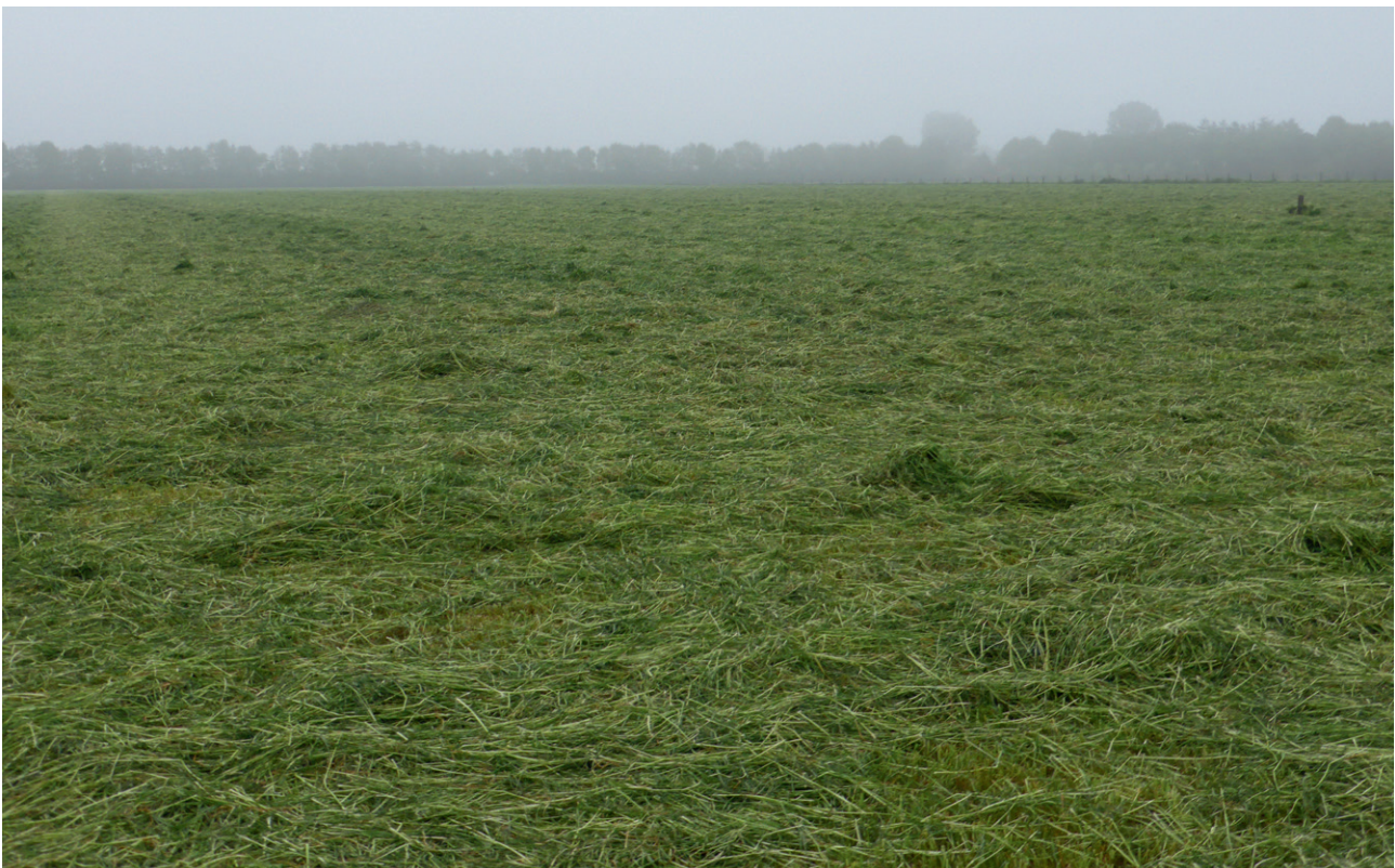
Figure 11: Test area before the measurement runs

The additional trial runs with the KRONE Swadro TS 680 Twin also show that increasing the raking height to 4 cm at a travel speed of 8 km/h causes raking losses to increase only slightly to 0.9 % (+). Although, at the high travel speed of 10.5 km/h, the raking losses exhibited a stronger increase when the raking height was increased to 3.5 cm, they still remained at a relatively low level at 1.5 % (+) (see Figure 11).