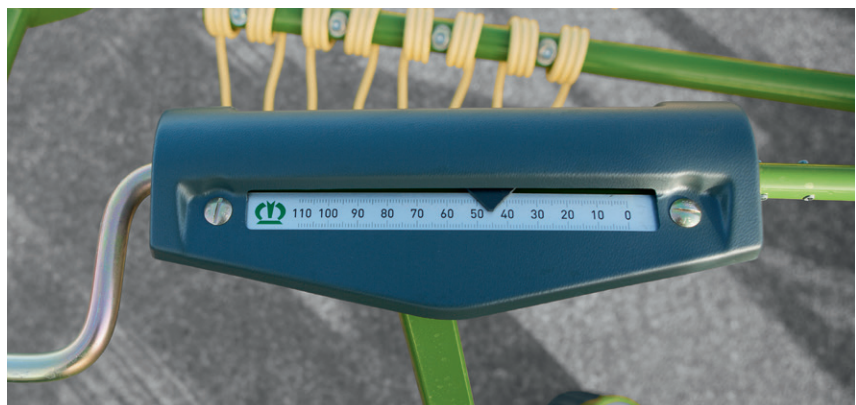
Figures 2 to 6:

(Above) "Lift tines" with crooked ends, eccentric pivot pins, adjustment of cross slope using fine-step hole pattern, mechanical and (below) electrical adjustment of working height