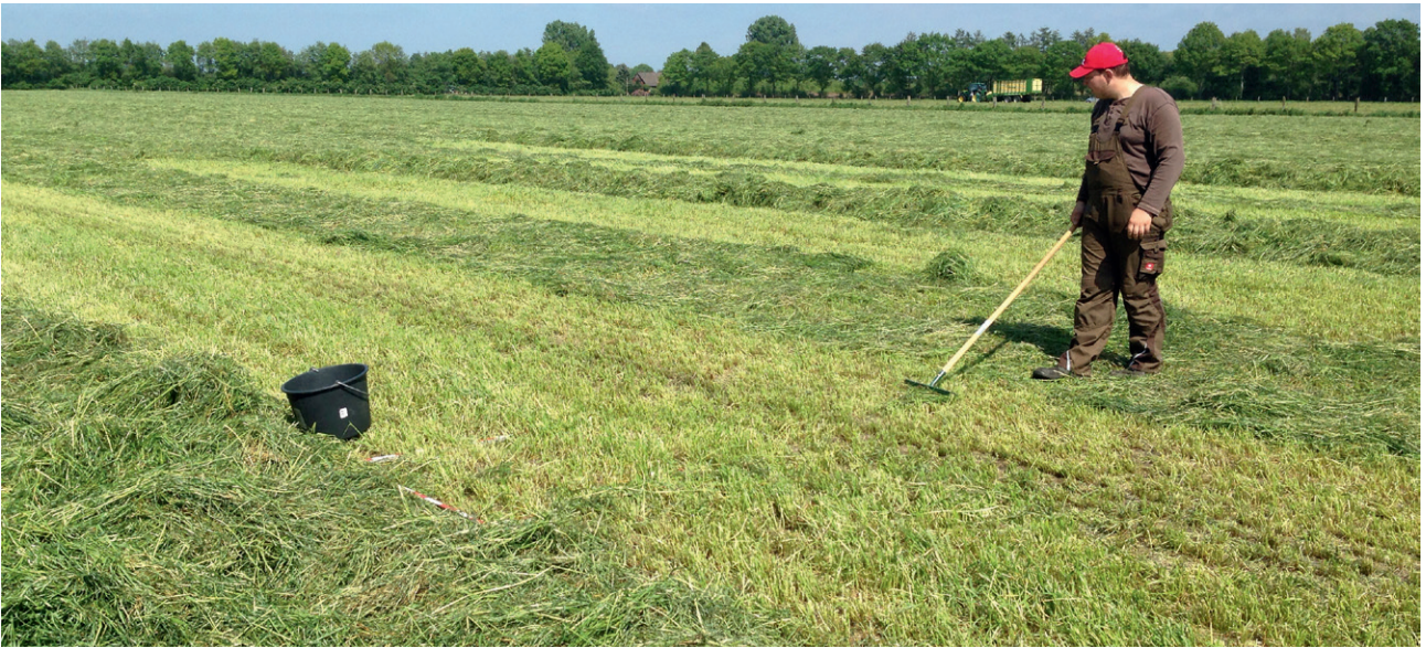
Figure 8: Recording the raking losses by raking up and weighing the residual stalks