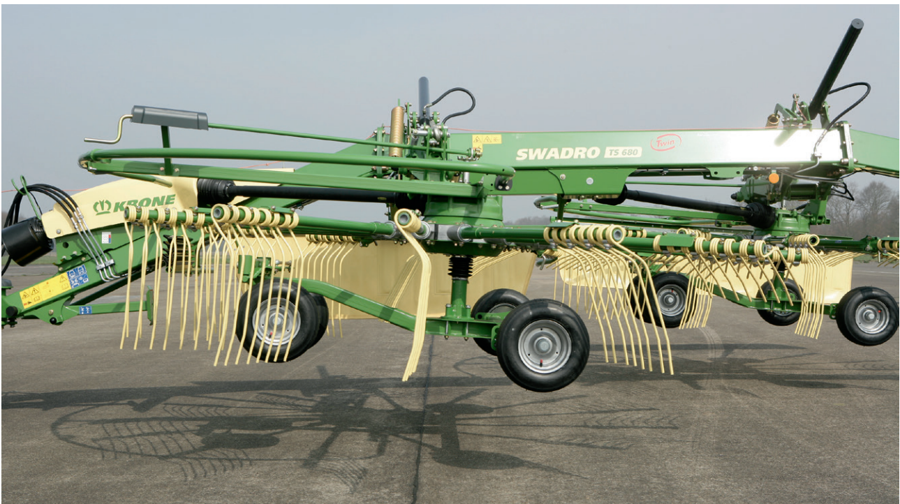
Figures 14 and 15: Attaching the KRONE Swadro TS 680 Twin to the tractor, rotor unit lifted out (KRONE product photos)